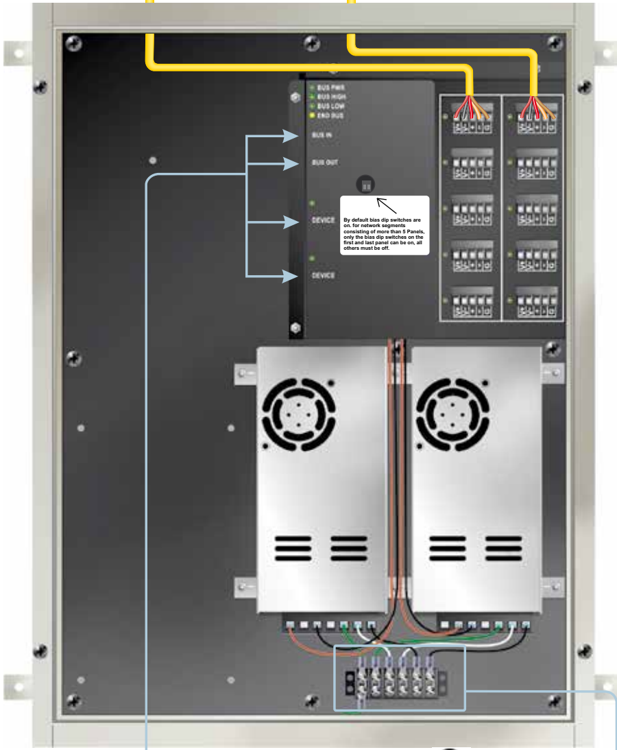
Power Panel for SDN - Part #1870259